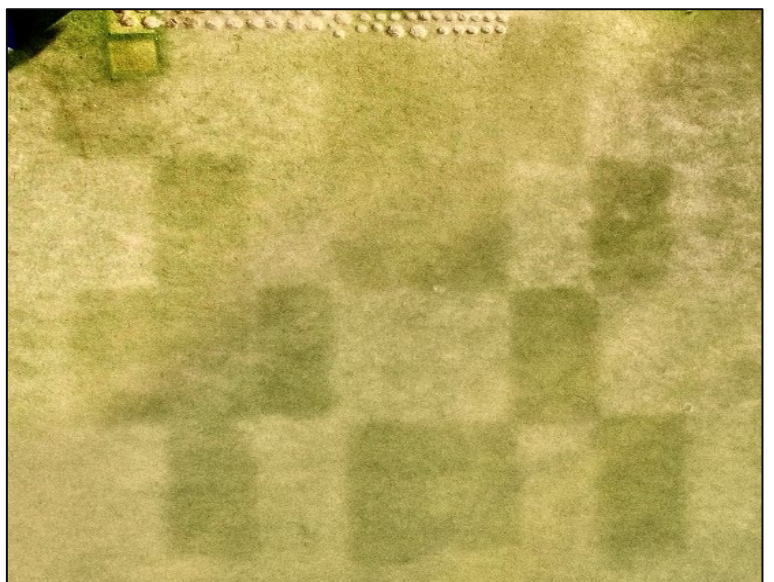
Left: No visible treatment differences in the trial during 2023 due optimal growing conditions—a “bull market” for turf health. Right: Treatment differences appeared in June 2024 during a stressful “bear market” for turfgrass.

The most surprising aspect of this discovery was the delayed effect. It took nearly a year for the treatment to manifest visibly, much like a wise investment that doesn’t immediately pay off. In 2023, the green enjoyed near-ideal conditions for bermudagrass growth: optimal fertilization, watering, and low traffic—akin to a “bull market” for turf health. But by 2024, the green was under considerable stress. Heavy foot traffic, minimal irrigation, low fertilization, and unusually hot, dry weather had all taken a toll—what we might call a “bear market” for turfgrass.