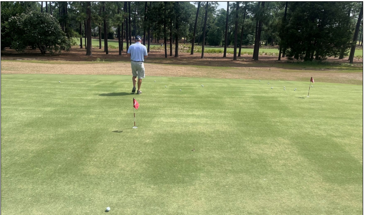
Resilia and Indemnify plots were still visible on August 23 rd , 2024. Treatments were applied four times from April through July 2023.

This trial underscored the importance of long-term planning in turf management. A year may seem like a long time for visible results, but the protection and resilience offered by Resilia can make all the difference when conditions become less than ideal.