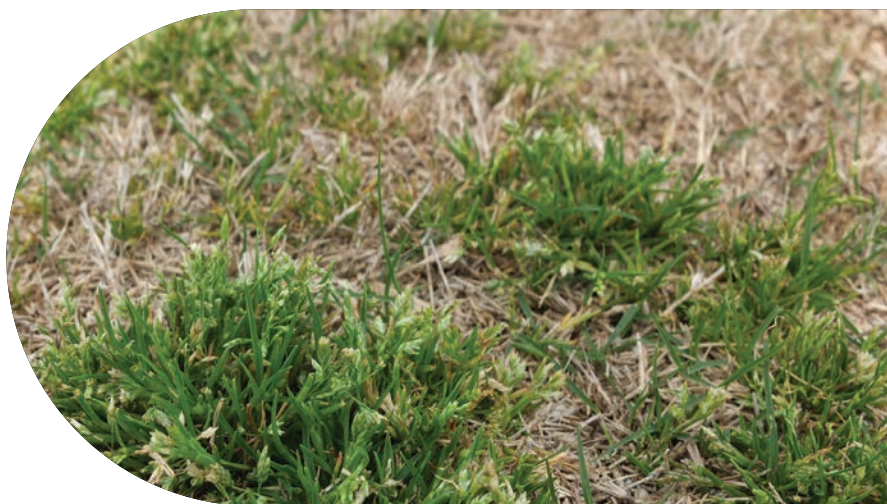
Poa annua is a winter annual that germinates during fall when soil temperatures drop below 70°F."

Poa annua (annual bluegrass) is arguably the world's most problematic turfgrass weed, with herbicide resistance becoming a growing problem for turf managers. University research has shown that tank-mixing herbicides with different modes of action is more effective at limiting resistance than rotating herbicides with different modes of action.