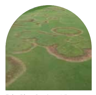
Fairy Ring: Castlon + Mirage Stressgard effectively suppresses fairy ring along with other root diseases.