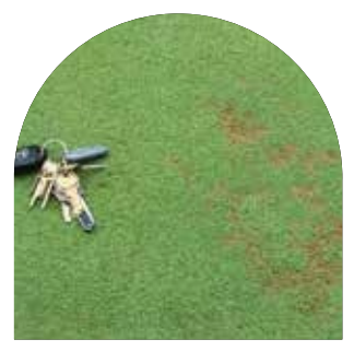
Leaf Spot & Melting Out: MiraCast is an effective combination for leaf spot and grey leaf spot.