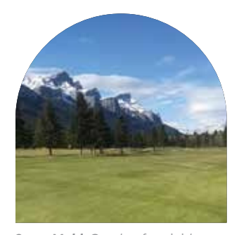
Snow Mold: Castlon fungicide can complement Envu's Interface and Mirage Stressgard snow mold program, as a primer application or part of the tankmix in the final application.

Special 2024 Offer: Purchase a 1+ jug of Castlon with 1+ jug of Mirage Stressgard and receive a $50 rebate* on each bottle of Mirage Stressgard.